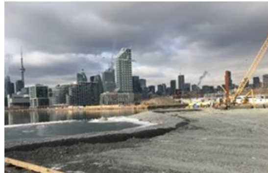
Toronto Waterfront, Don River Project Filling - MECP, Jan. 2019