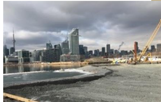
Toronto waterfront, Don River project filling - MECP, Jan. 2019